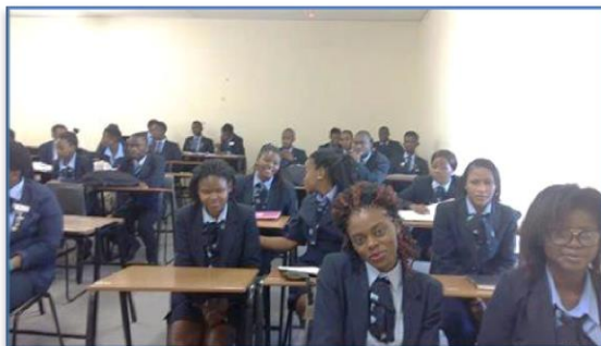
The follow-up was participation in an event.