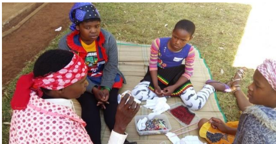
Photo: Community members are selected, trained and jobs created. Many have different skills. Here the activity leader in a Time Travel event is educating learners on Zulu traditional beads, meaning of colours and patterns and making them.