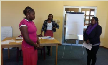
Role Play at the training session.

Oral History recording training- Facilitated by Killie Campbell Library and museum (University of KwaZulu-Natal). The trained personnel were deployed to undertake oral recordings of those who were subjected to forced removals