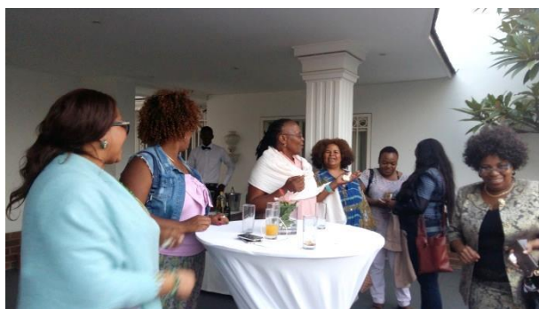
Reception at the Finnish Embassy