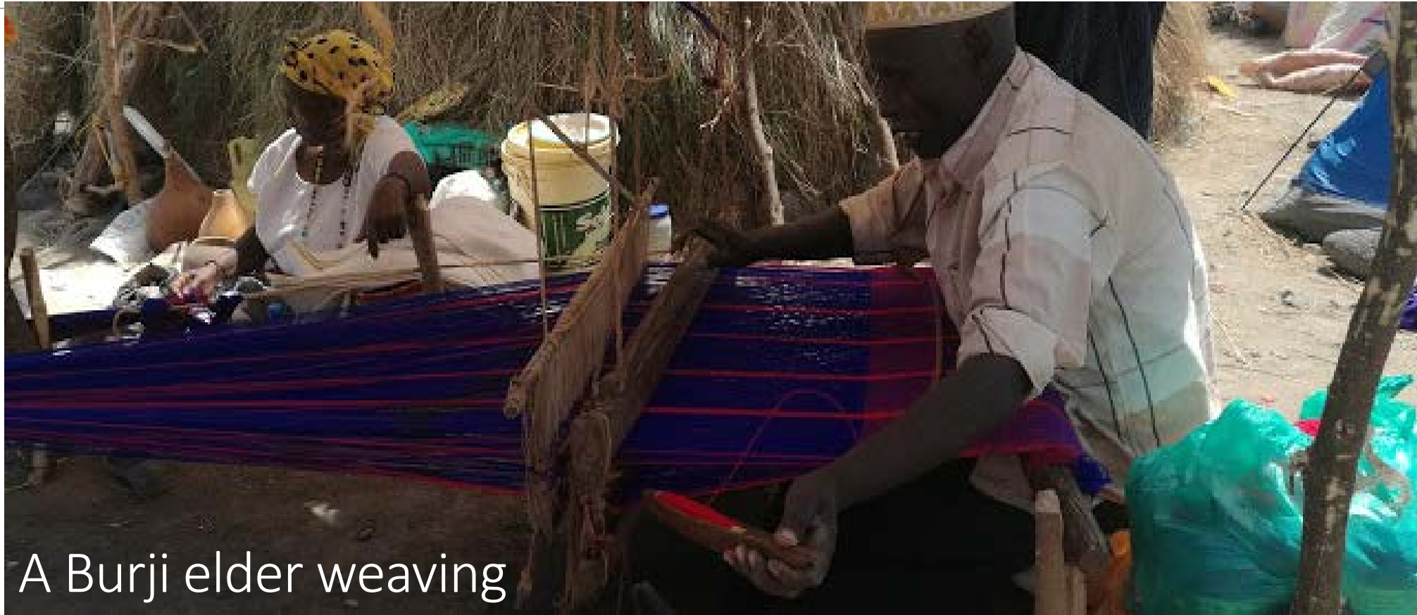
A Burji elder weaving

...Time travel can weave the 14 communities into a peaceful , prosperous and more resilient Marsabit County