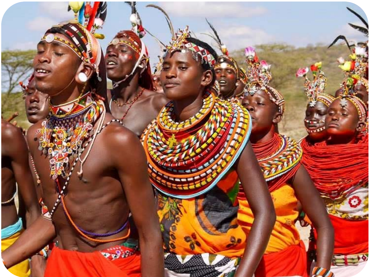
Samburu Traditional dance