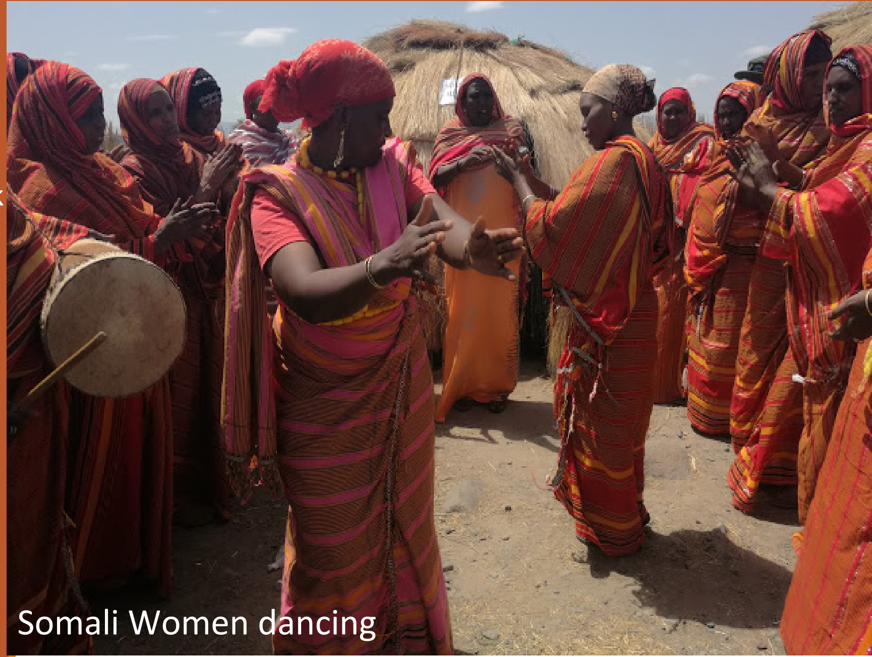
Somali Women dancing

3. Promoting Marsabit County Annual Cultural Festival.