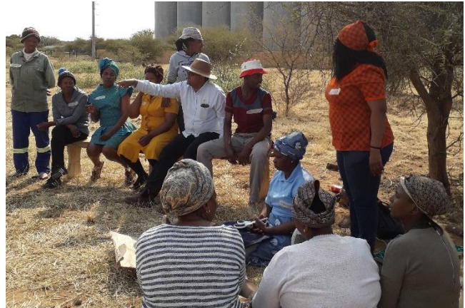
Intensive discussions, Go to war or negotiate?

coordination of the Time Travel method in North West. The Ikageng Time Travel group in Potchefstroom, with many years of Time Travel experience, is a good support.