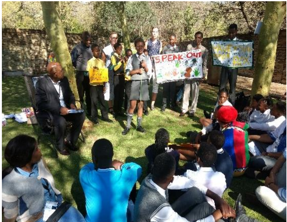
Time Travel event at Freedom Park, how to meet the challenges of today?