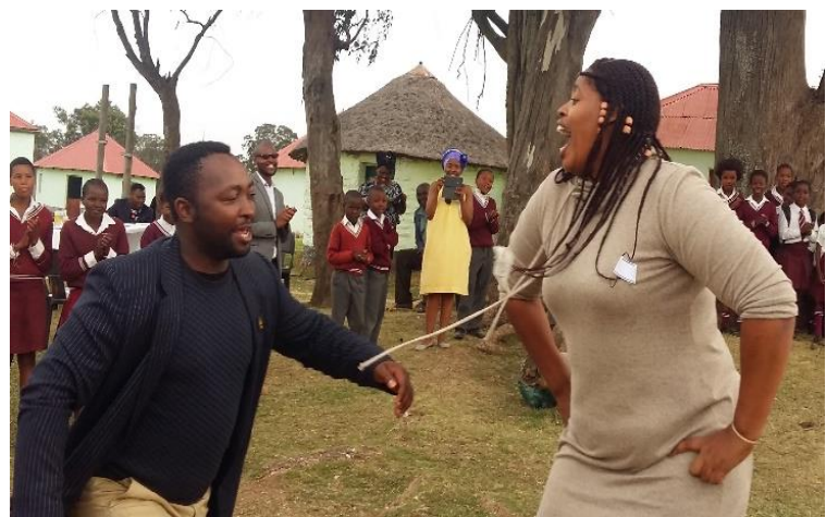
Dancing, a highlight of the Imbizo.