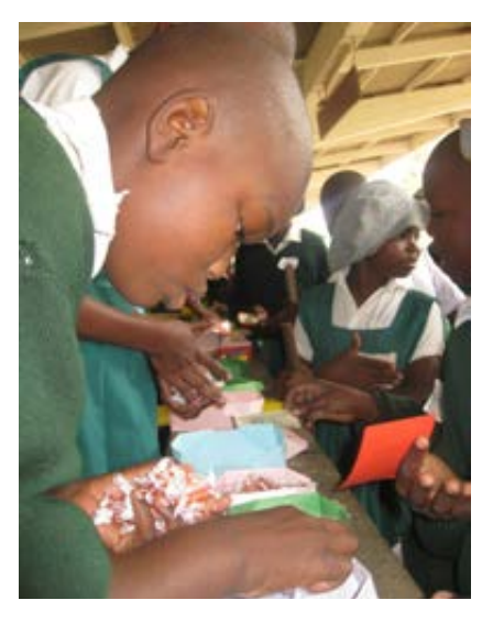
Designing boxes and filling them with sweets, a delicate job for the shop assistants.