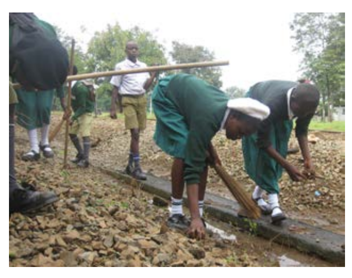
Cleaning of the railroad track. How many persons are needed, and how fast do they have to do it, to finish the cleaning before the first train arrives?