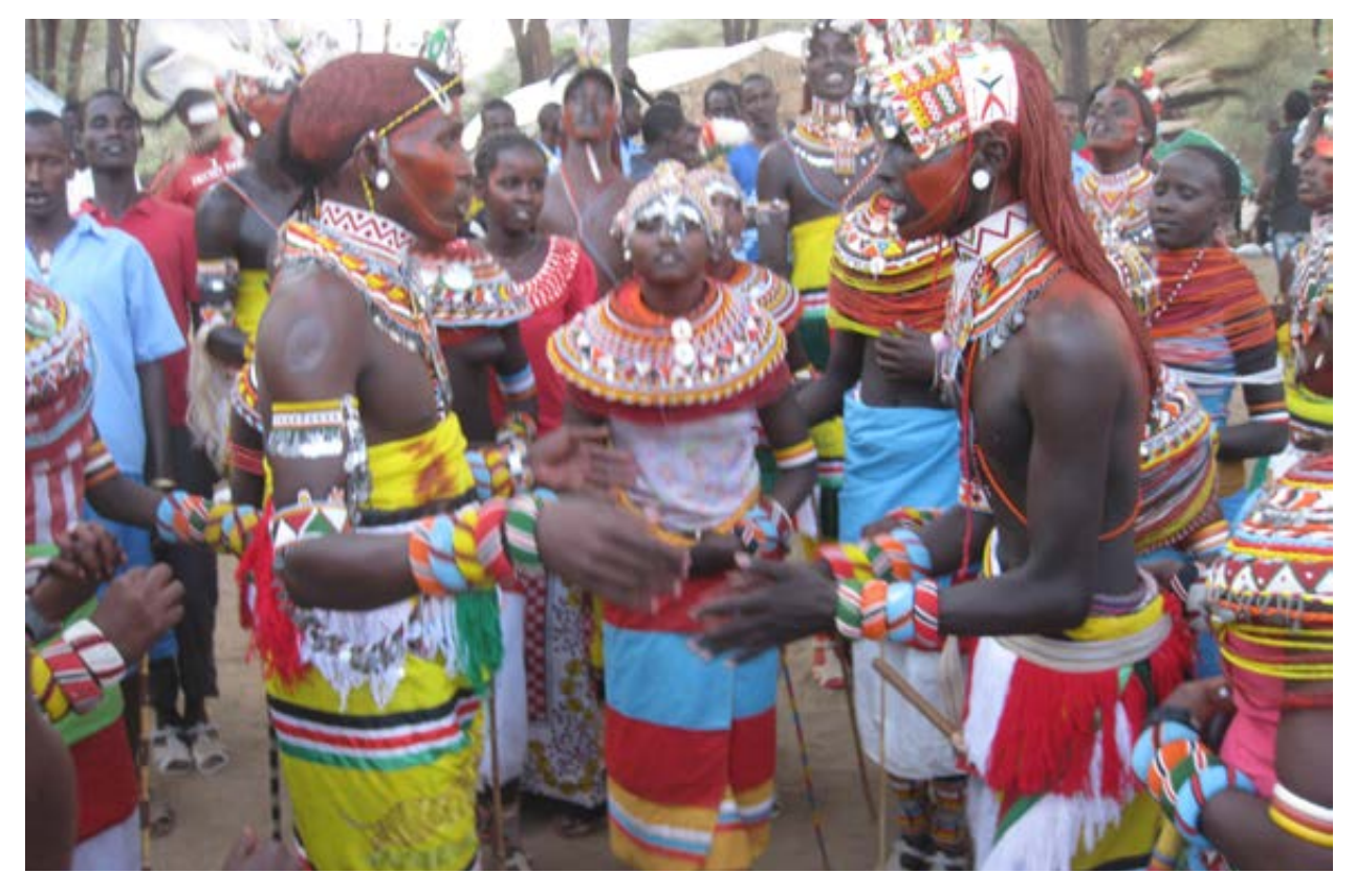
There was a lot of dancing and singing by women, morans and community members welcoming the conference delegates and even more in the huge cultural event with the whole community.