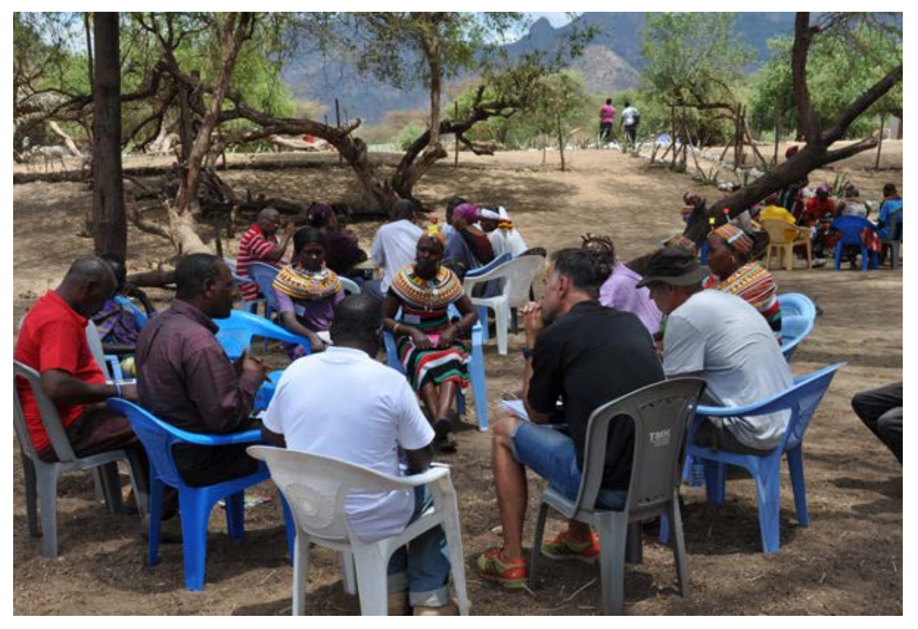
Group discussions on how the use heritage and education in community building. Vivid discussions and creative ideas.

More information from the conference on the Bridging Ages website, www.bridgingages.com