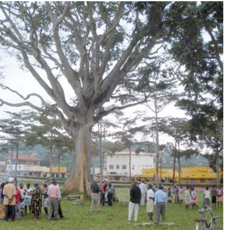
A gathering at the Freedom Tree in Entebbe.

The tree was the place for political meetings and rallies before independence in 1962 and has become a symbol for freedom and independence.