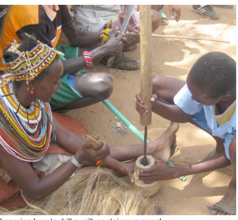
Learning how to drill a milk container, a guord.