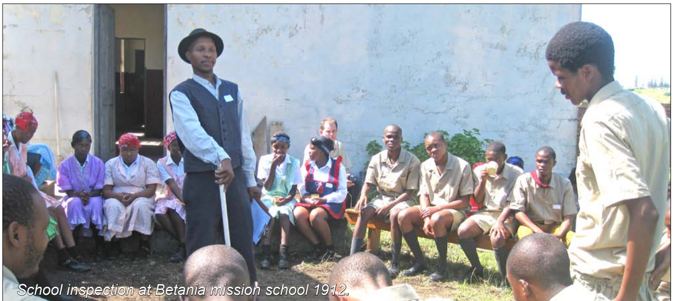
School inspection at Betania mission school 1912.

Key questions: Is education important? Why? Does everybody have a chance to equal and comparable education on all levels? If not, how can we achieve that?