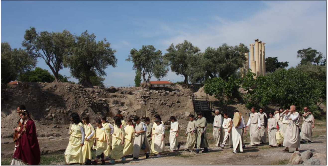
People from Smyrna entering the Athena temple 590 B.C.