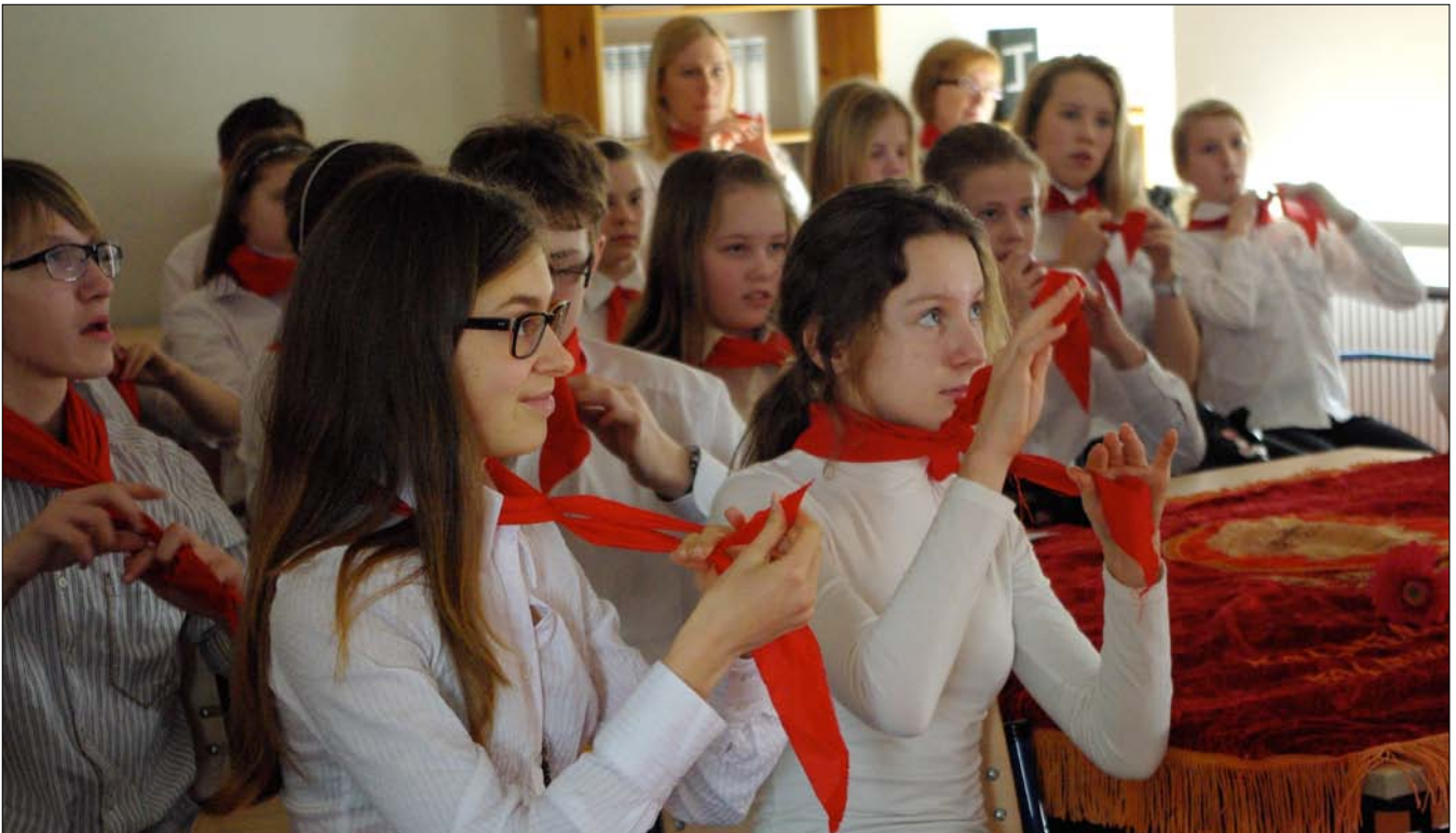
Pioneers checking their skills in tying red scarves.