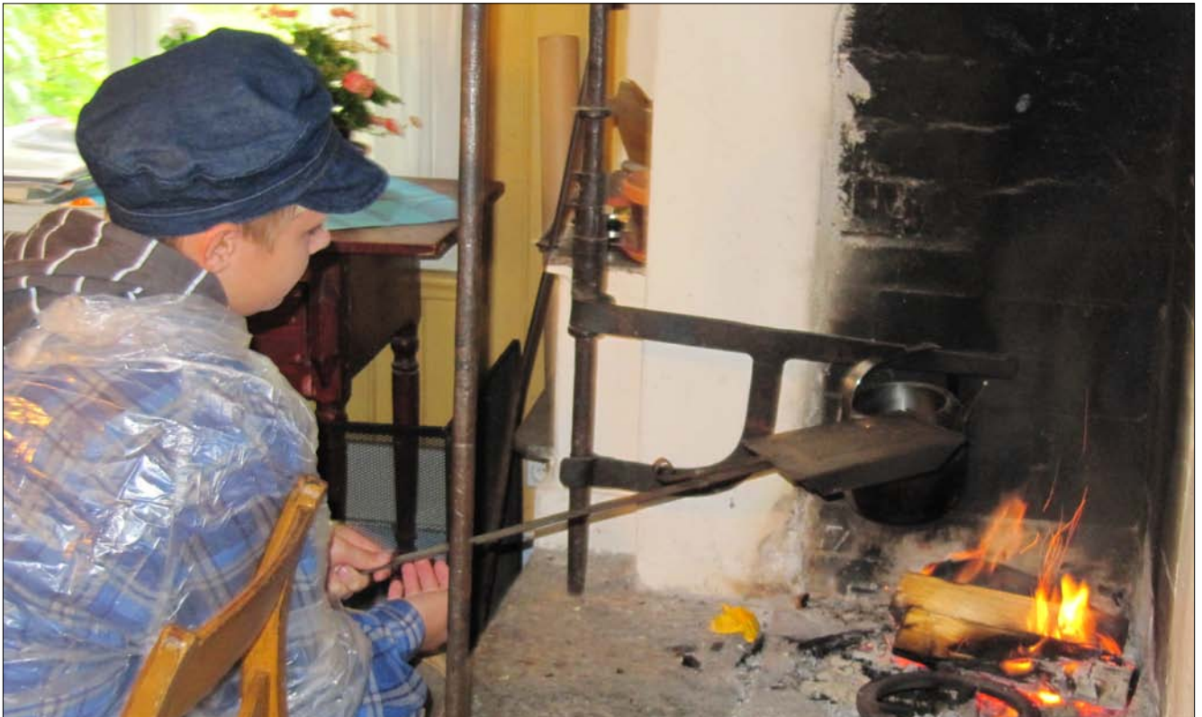
Roasting coffee substitute at the Home front Time Travel 1943 in Vasa.

Time Travel requires a lot of work! Where will you find the time? Not to talk about the resources, the people and the props? What if you are a small museum, but want to give the opportunity to many pupils to experience a Time Travel?