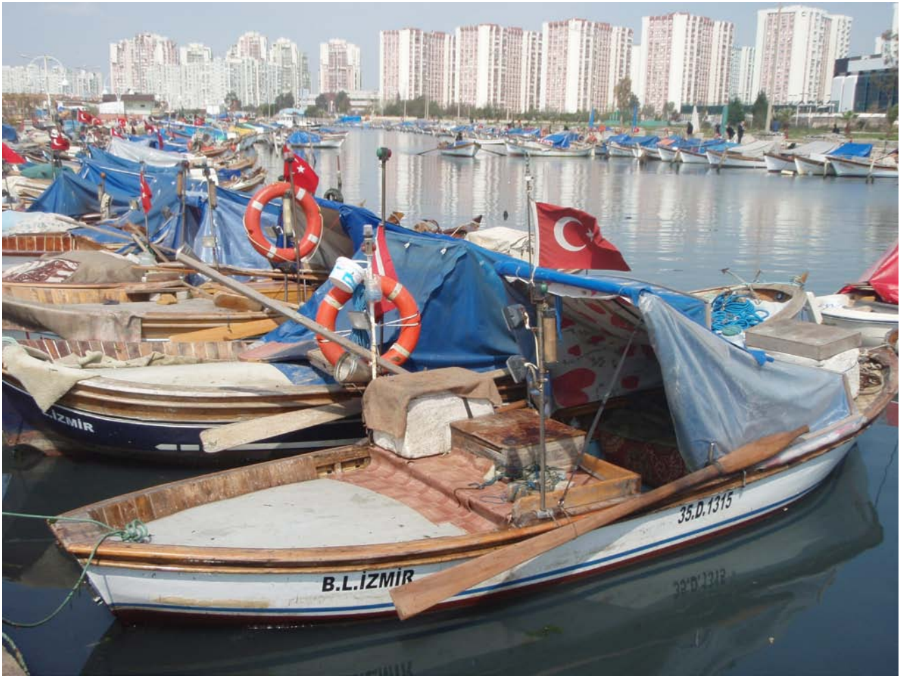
Izmir of today.