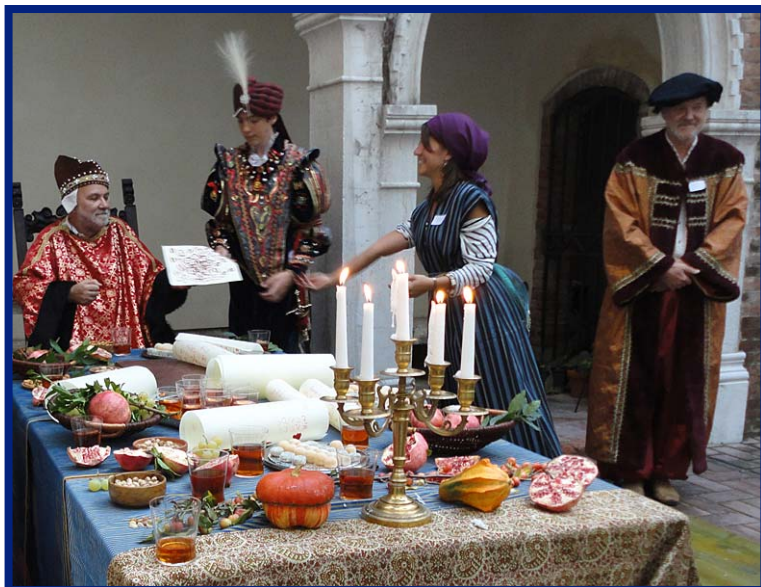
The signing of the peace treaty in 1454