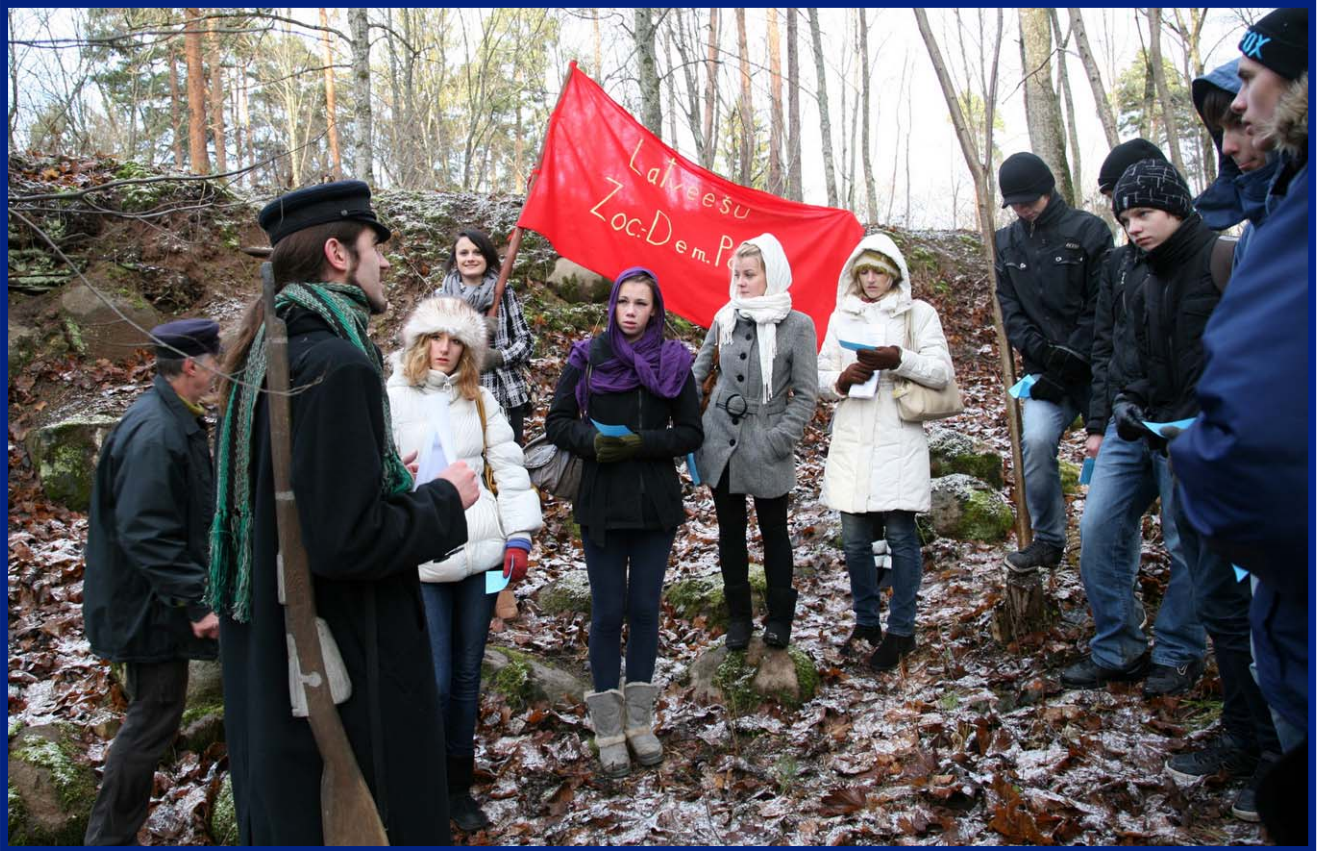
Illegal meeting in 1905. Start a revolution for independence?

The Time Travel “Let’s experience 1905” was elaborated at the Tukums Museum in Latvia six years ago. It is a popular programme not only for local schools but also for others. Each year early December Grade 9 and 12 students and their history teachers participate in the illegal meeting in the park of Durbe Manor 1st and 2nd of December 1905, one of the most controversial events in the history of Latvia.