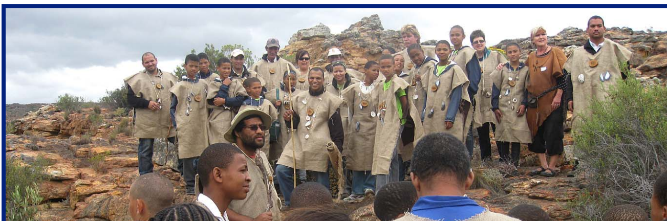
A Time Travel to 1460 in the Cederberg mountains was part of the Spring School. A group of pastoralists meet a group of hunter-gatherers. Living with differences?

For more information on CapeNature and the Greater Cederberg Biodiversity Corridor: www.capenature.co.za and www.cederbergcorridor.org.za