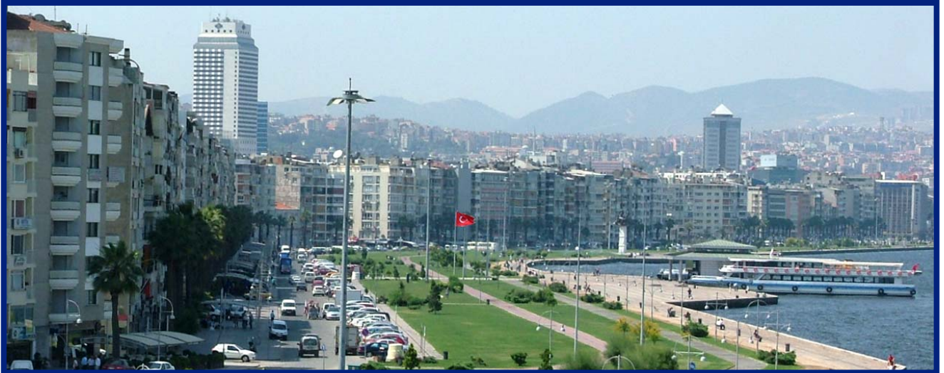
İzmir by the Mediterranean Sea