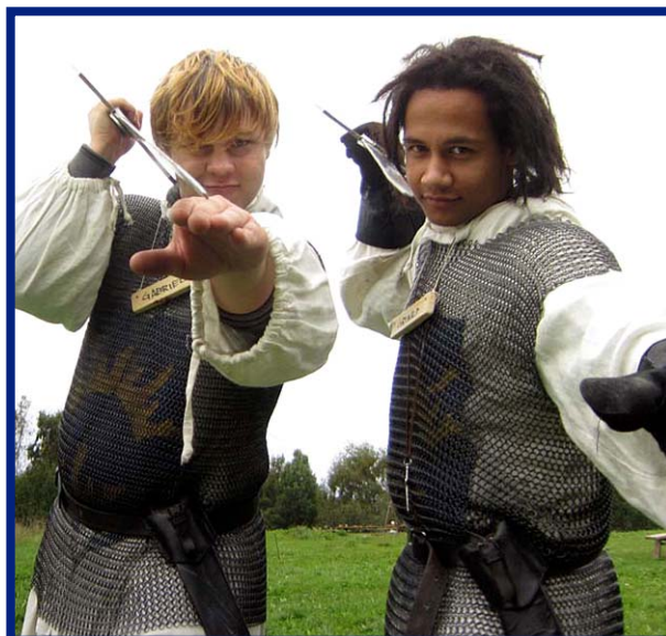
Prepared to defend Korsholm's Castle in 1395