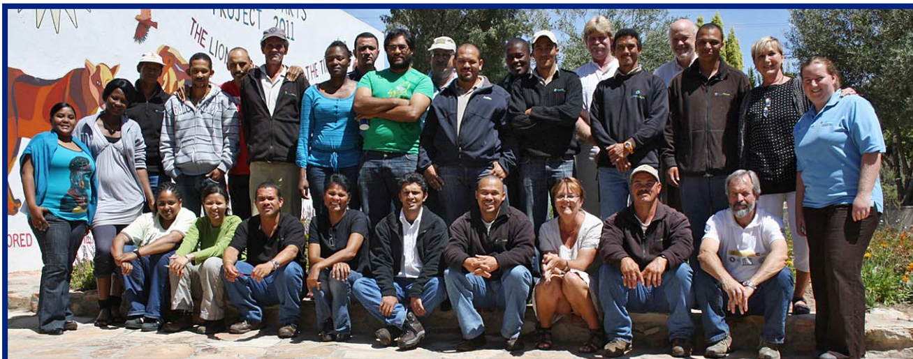
The participants of the Landscape Education training course, Clanwilliam, October 2011

CapeNature is a public institution with the statutory responsibility for conserving the unique natural heritage resources of the Western Cape (South Africa) for the benefit of all. CapeNature, with the guidance, support and expertise of international and local partners, rolled out the CapeNature Spring School in October 2011. Each year this Winter/Spring School is hosted to build internal capacity around specific thematic areas. The theme of the CapeNature Spring School for 2011 centered around capacity building to implement Landscape Education and Time Travels. The team from Kalmar County Museum and Bridging Ages South Africa exposed the participants to the methodology, including theory and practical. The Spring School was hosted in the Clanwilliam and northern Cederberg area. The Cederberg Wilderness Area is a World Heritage Site, rich in both natural and cultural heritage.