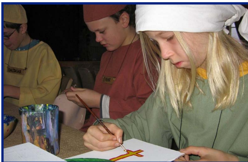
Will the cross help to resist the plague? Primary school learners in a Time Travel to the Middle Ages