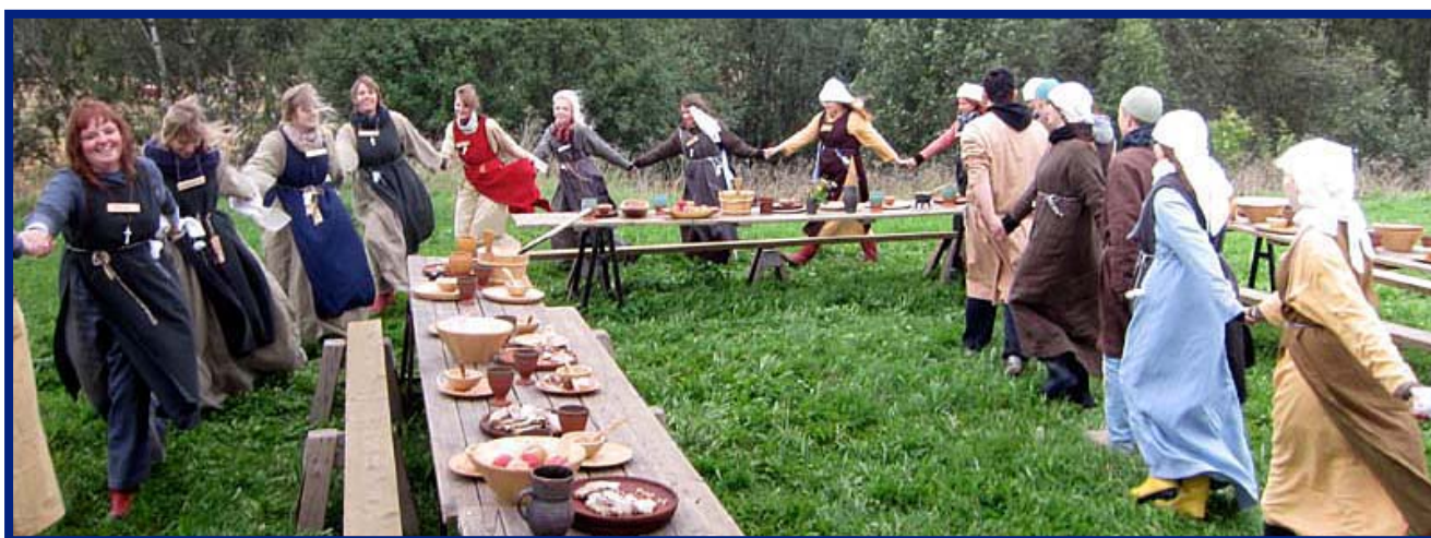
Celebrating peace at the castle in Korsholm. Students from Fria Kristliga Folkhögskolan in Vaasa in the Time Travel to 1395

In November each year Fria Kristliga Folkhögskolan arranges "Finland-Swedish Medieval Time Travels" for pupils in several primary school classes. The Finland-Swedish Medieval Days have become well known and appreciated.