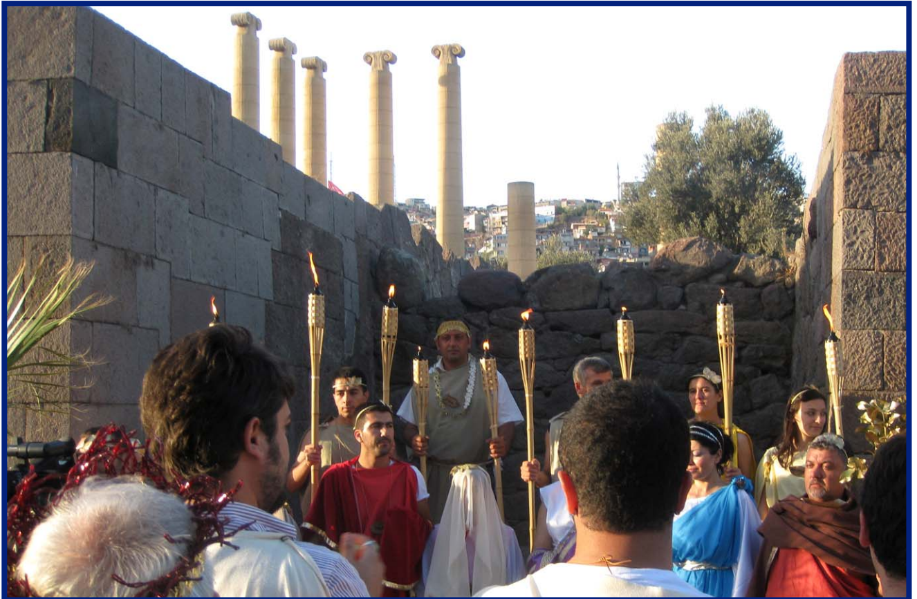
A wedding at the Athena Temple in Smyrna, 590 B.C.