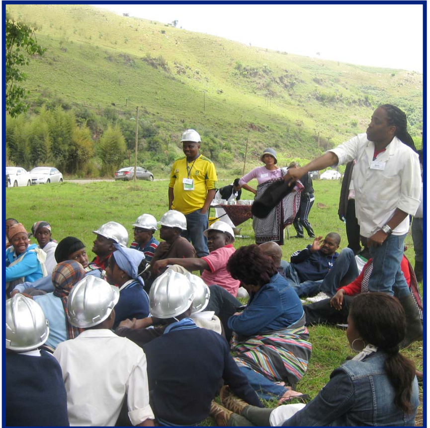
The black miners are frustrated and angry when the white miners go on strike. No work, no pay. No money, no food. Time Travel to 1922 at Pilgrim's Rest