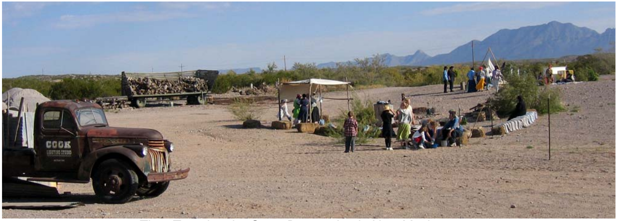
Time Travel to the Great Depression in New Mexico 1937.

Time is a cultural marker that is used in Time Travels. Jon gave us four examples from Time Travels in Las Cruces: 1776 and life on El Camino Real (the royal road), 1887 and the Wild West, 1937 and the Great Depression and 1912, when New Mexico became a state.