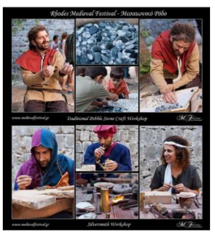
Exhibitions of photography and photo contests, related to heritage and the festival, are also parts of the agenda. Participating artists and re-enactors are mainly from Greece and Europe.

All forms of arts and crafts, related to medieval/byzantine heritage, are hosted at this festival: theater, street theater, puppet theater, juggling, historic dances, other interactive events inspired by history, live music, storytelling, re-enacting and also pageantry, byzantine art and traditional crafts.