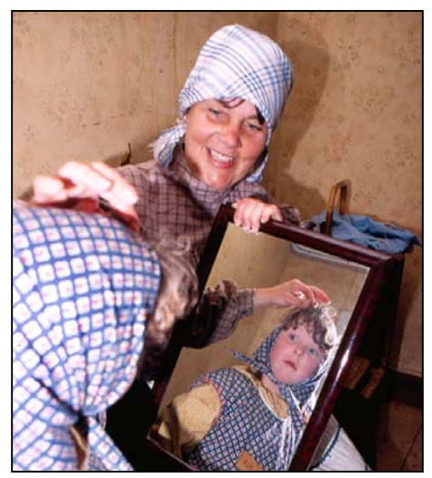
Look how beautiful I am with curls in my hair.