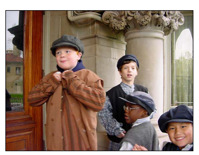
Is this west right for you?

By the means of a magic crystal ball and a rhyme the children travel back 100 years to the time when their great grandmother was a child.