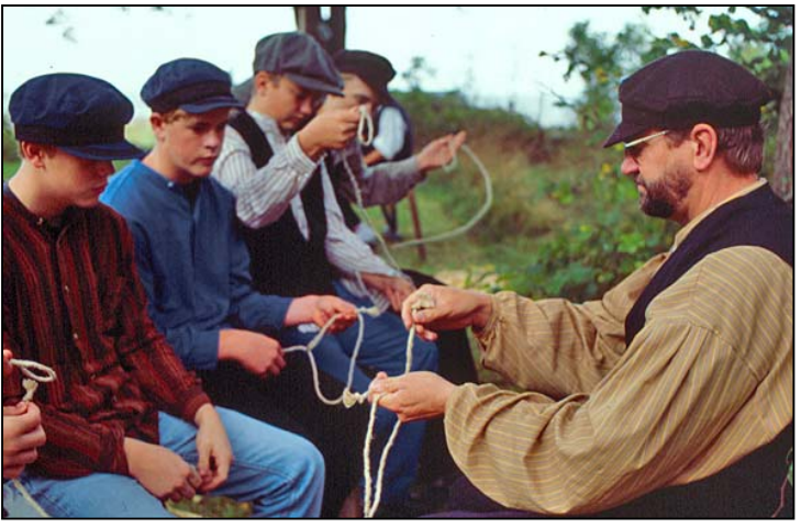
The sailor teaches the boys how to make knots and splice ropes. His remarkable stories from his voyages should be taken with a pinch of salt. Nothing for the ears of young children!