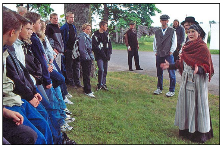
Museum staff gather the group of "sceptical" teenagers.