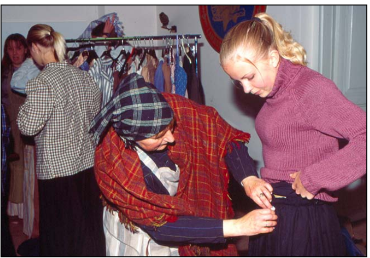
Everyone changes into period clothes.