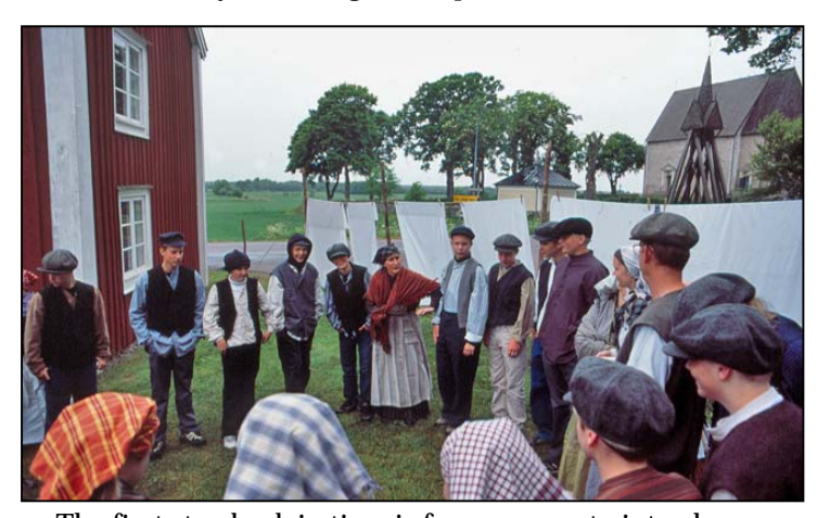
The first step back in time is for everyone to introduce themselves in character.