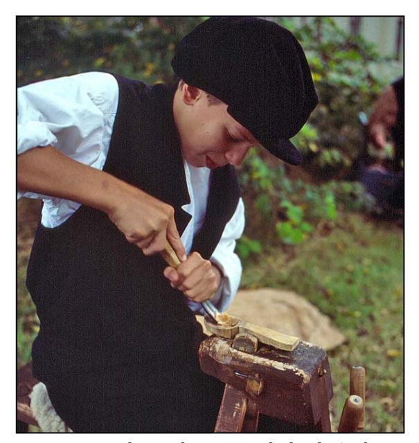
We get started straight away with the day's chores. Some of the boys are given the task to make wooden spoons and clothes pegs.