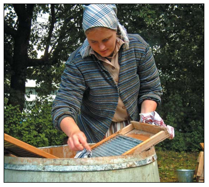
Rag rugs and clothes have to be washed, the floors scrubbed, butter churned and food has to be prepared.

Then we can sit down together and talk about all the new things that have come: the telephone, the railway and steamboats. Somebody has decided to go to America. Another receives a letter from there. Can we really believe that everything is so much better over there? Should we, who choose to stay, fight for a common cause and build trade unions in order to improve life? Dare we protest, maybe even go on strike? The questions and opinions are many, but soon we will have to return to our chores.